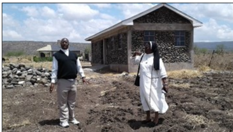
Property to be purchased

Since the congregations in Mexico have been and are still assisting the Society developing in Mexico, the United States congregations (located in Cleveland, Corpus Christi and Victoria) are supporting the emerging Society in Kenya. Each U.S. congregation has agreed to contribute $17,000 toward the purchase of this property—both land and housing. The present owner, excited about her property being used for a religious purpose, has graciously agreed to hold the property for our purchase until the end of March.