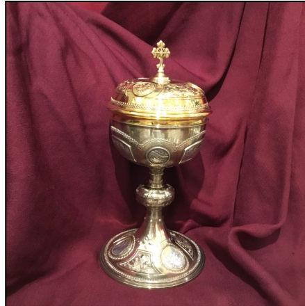
CIBORIUM OF PAUL VI